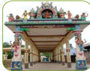
Veerapandi Gowmaariamman Temple