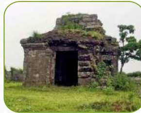
Mangala Devi Kannagi Temple